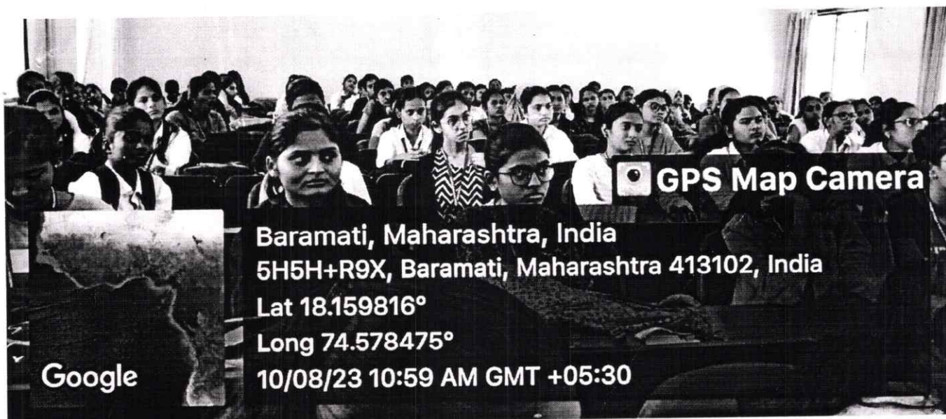
Audience of One Day Workshop on Health and Hygiene for girls