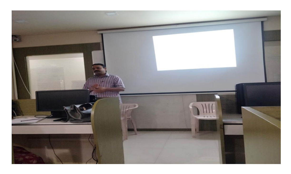
Presentation of F.Y.B.Sc. Papers