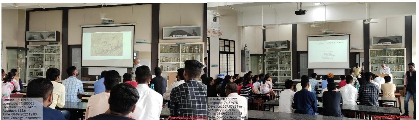
Guest lecture on 08" September 2022. EXPLORING THE WORLD OF ARACHNIDA