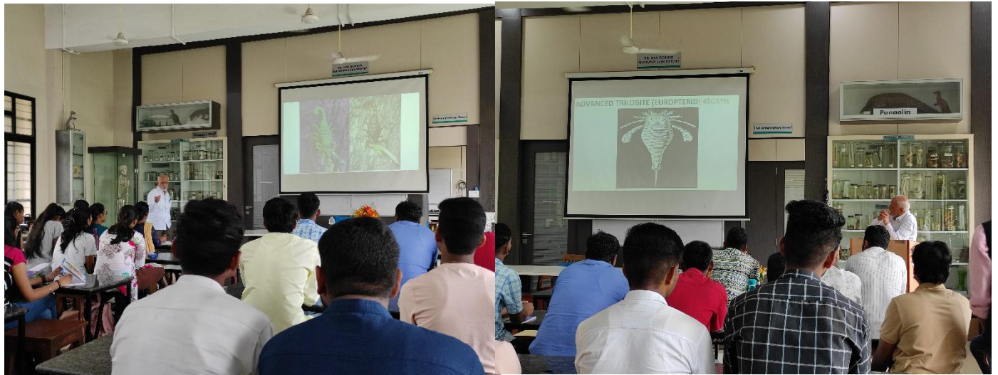
Guest lecture on 08" September 2022. EXPLORING THE WORLD OF ARACHNIDA