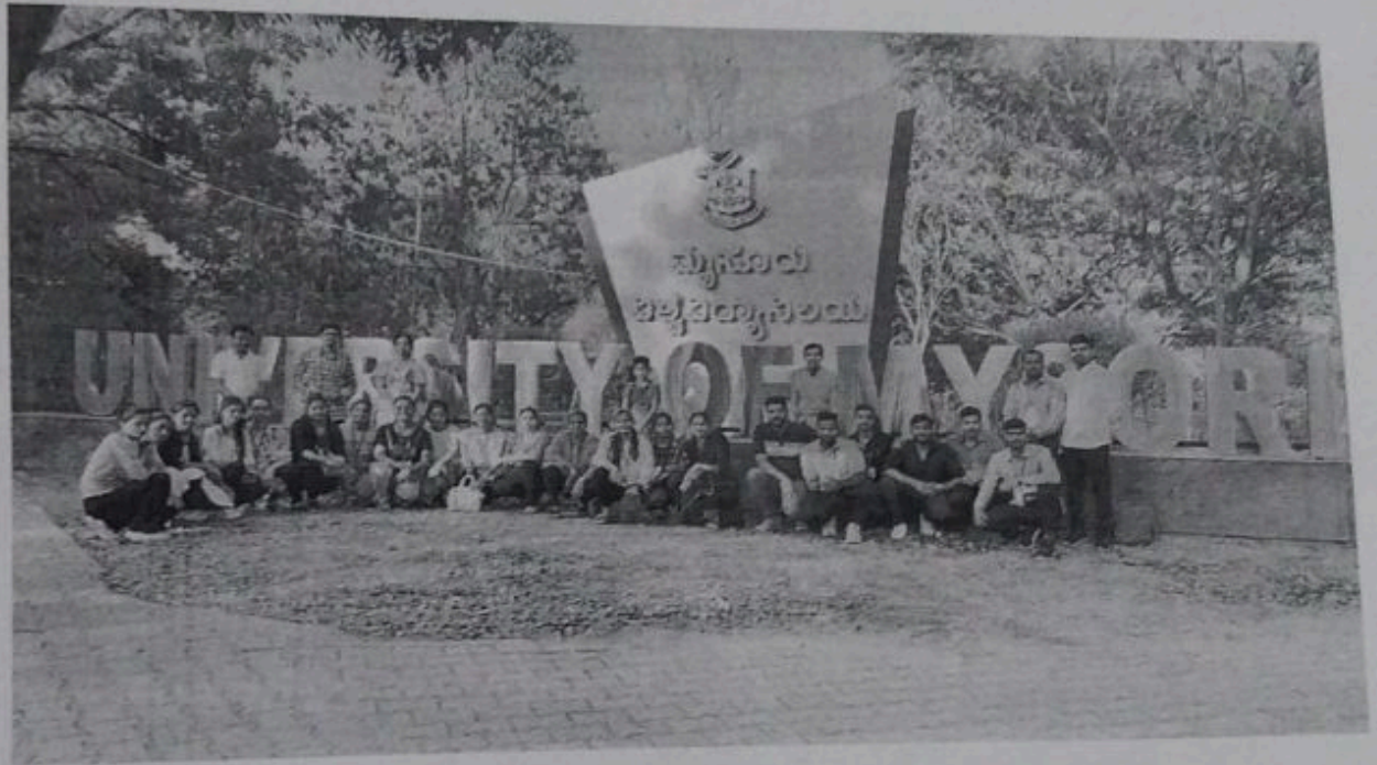
Study tour – M. Sc. II at Bangalore, Mysore, Ooty, Kanyakumari