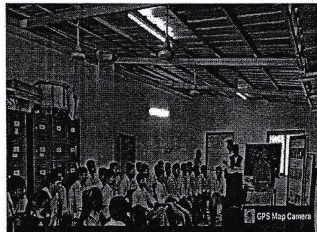
Tuljaram Chaturchand College Baramati, महाराष्ट्र, भारत Department of BBA(CA) Industrial Visit in Textronics Design Systems (I) Pvt. Ltd Lat 18.159553° Long 74.581294° 23/02/23 11:33 AM GMT +05:30