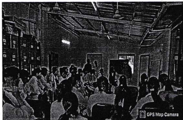
Tuljaram Chaturchand College Baramati, महाराष्ट्र, भारत Department of BBA(CA) Industrial Visit in Textronics Design Systems (I) Pvt. Ltd Lat 18.159553° Long 74.581294° 23/02/23 11:50 AM GMT +05:30