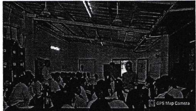
Tuljaram Chaturchand College Baramati, महाराष्ट्र, भारत Department of BBA(CA) Industrial Visit in Textronics Design Systems (I) Pvt. Ltd Lat 18.159553° Long 74.581294° 23/02/23 02:13 PM GMT +05:30