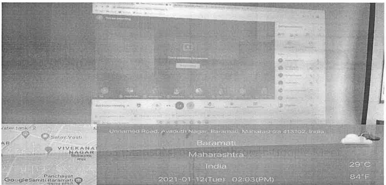
Snapshots of BoS (Statistics) meeting through Google Meet