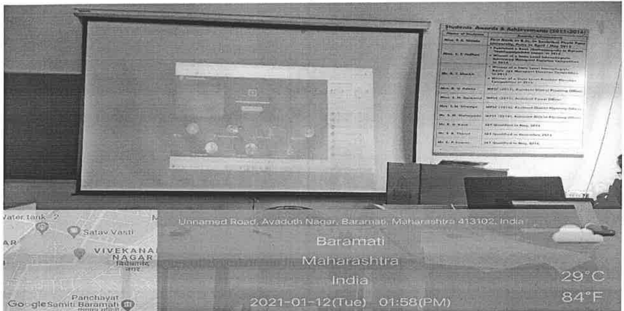
Snapshots of BoS (Statistics) meeting through Google Meet