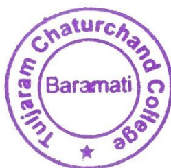
Principal Principal Tuljaram Chaturchand College Baramati

Coordinator Internal Quality Assurance Cell Tuljaram Chaturchand College of Arts, Science and Commerce, Baramati (Pune)-413102