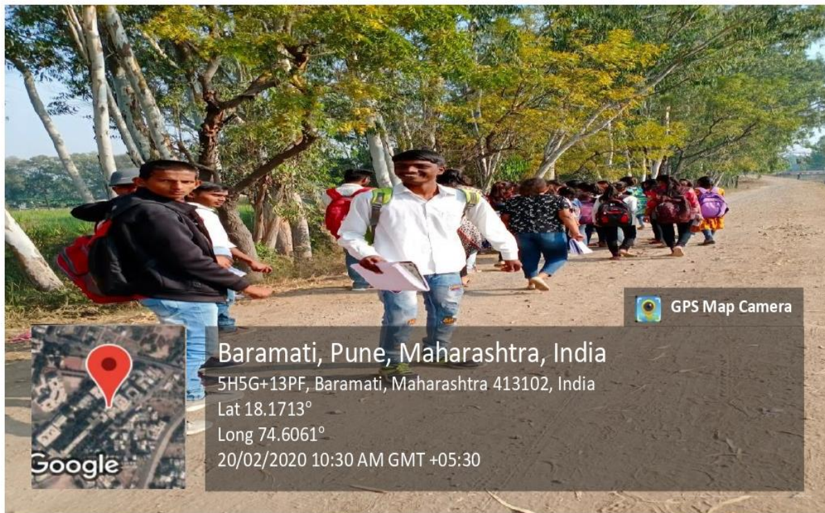
Students Observing farm irrigation