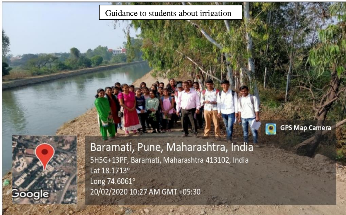
Students visiting to Irrigation Canal