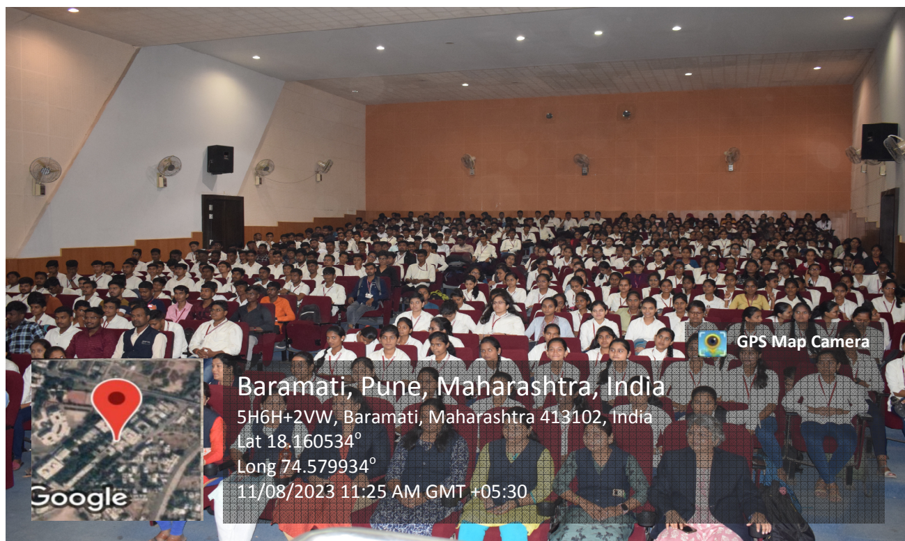
Students and Teacher Attending the Induction Program