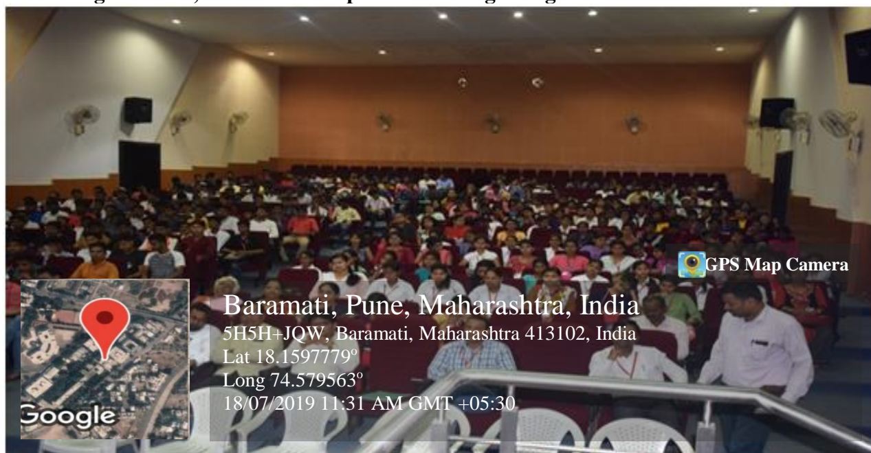
Students attending the Induction program 2019