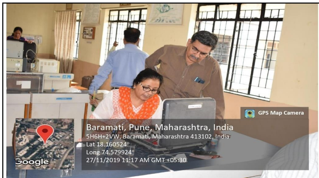
Guidance from the experts to laboratory staff on handling of equipments