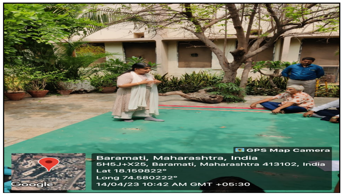
Teachers' interaction with resource person