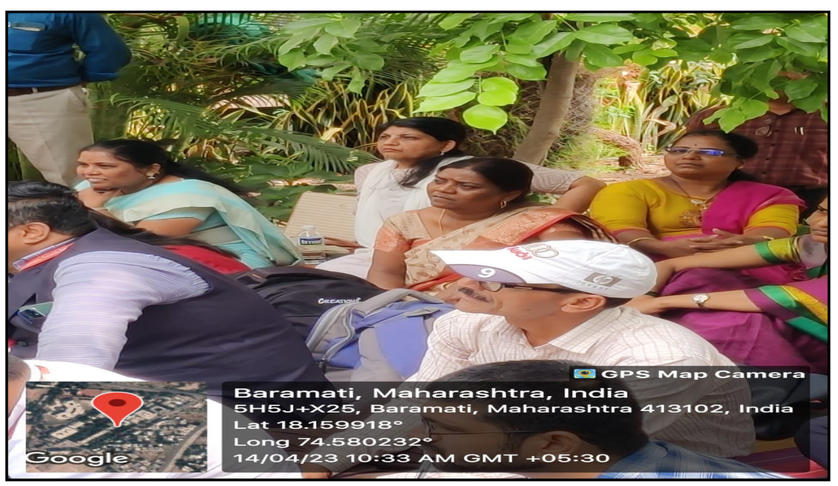
Teachers getting guidance from resource person