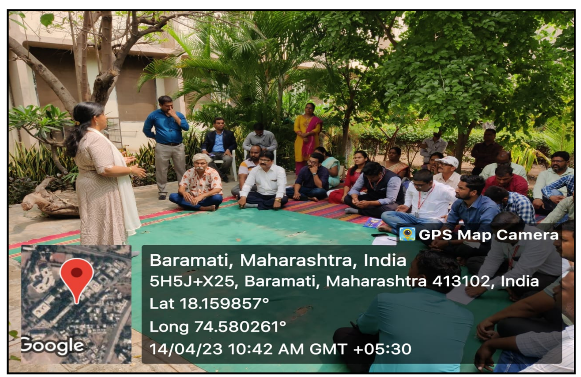
Teachers interacting with resource person