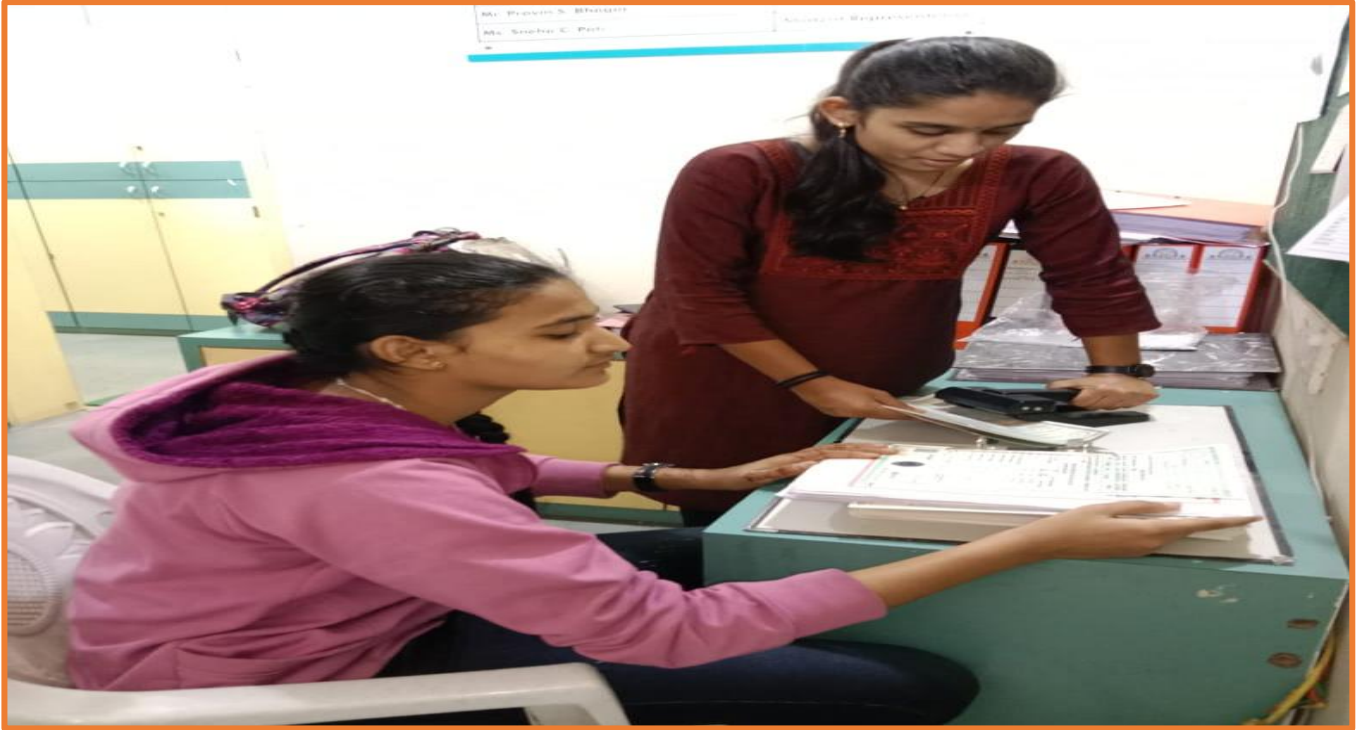
Earn and Learn Student working in administrative office.