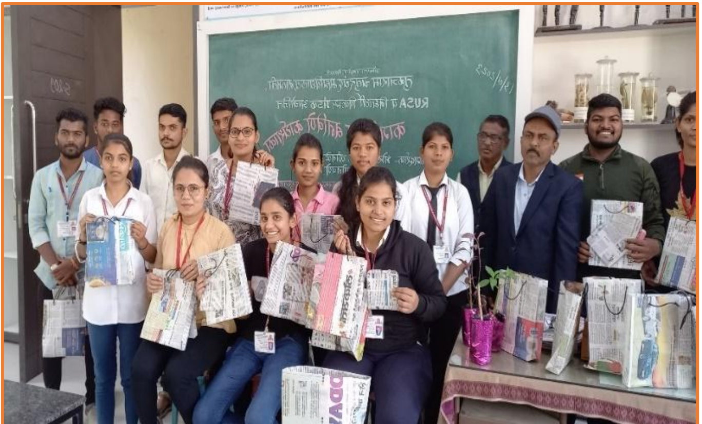
Participants are happy with their self made NEWS paper bags.