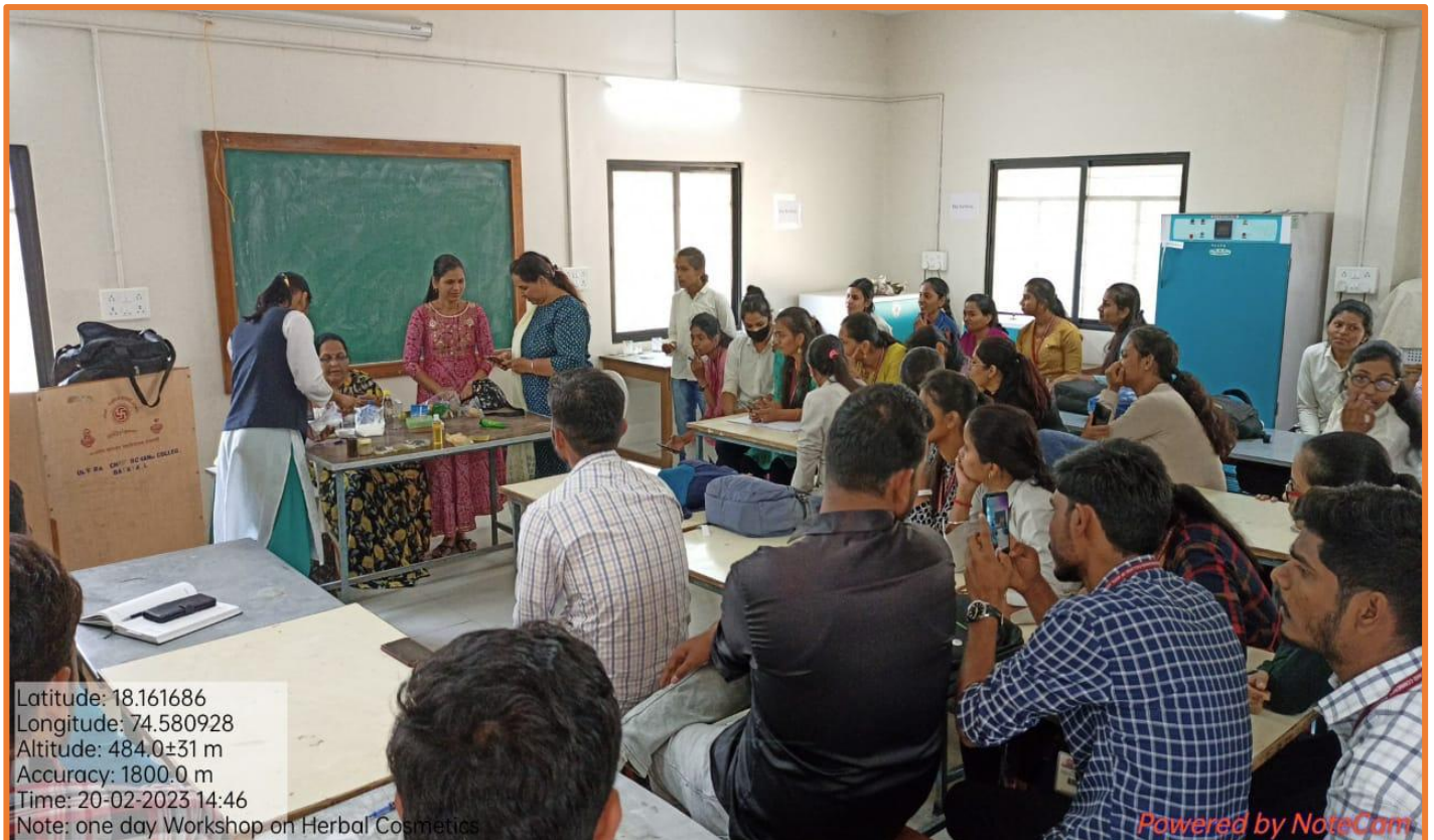
Demo of preparation of herbal cosmetics is being given by the cosmetic producer.