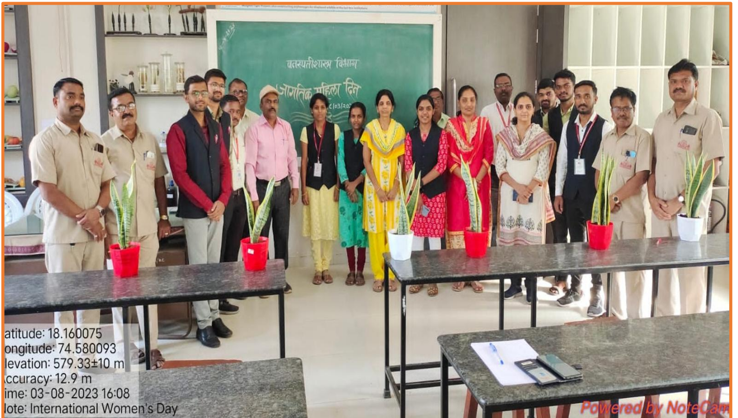
Celebration of world's women day