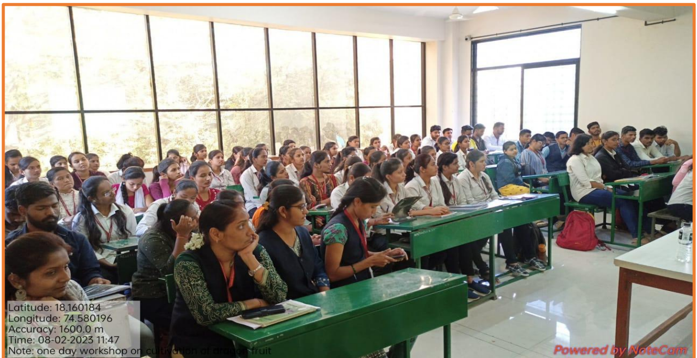
The participants attentively hearing the methodology of dragon fruit cultivation.