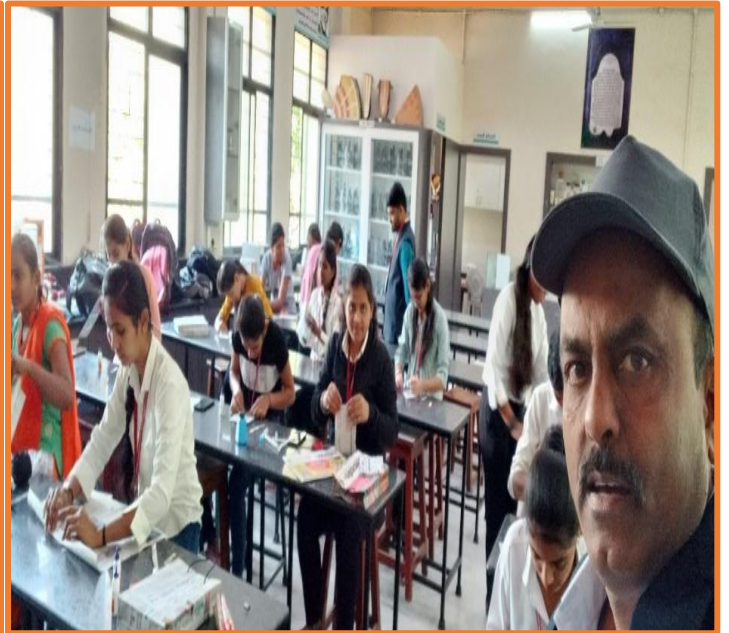
Participants are busy in making paper bags.