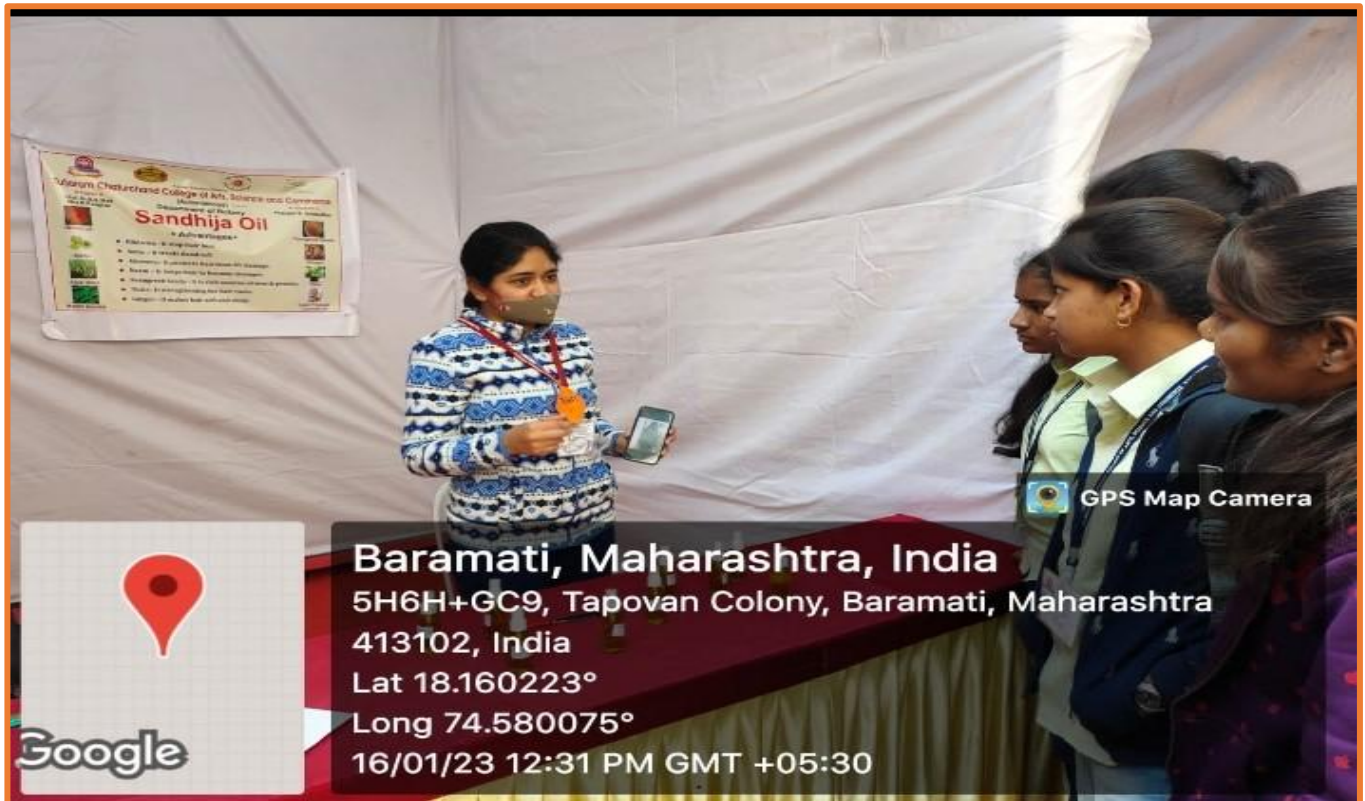
The participants selling their product in bussiness fair