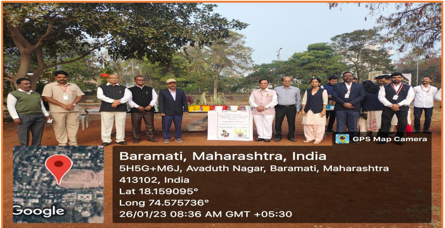
Dignitaries visited to the Surabhi Nursery.