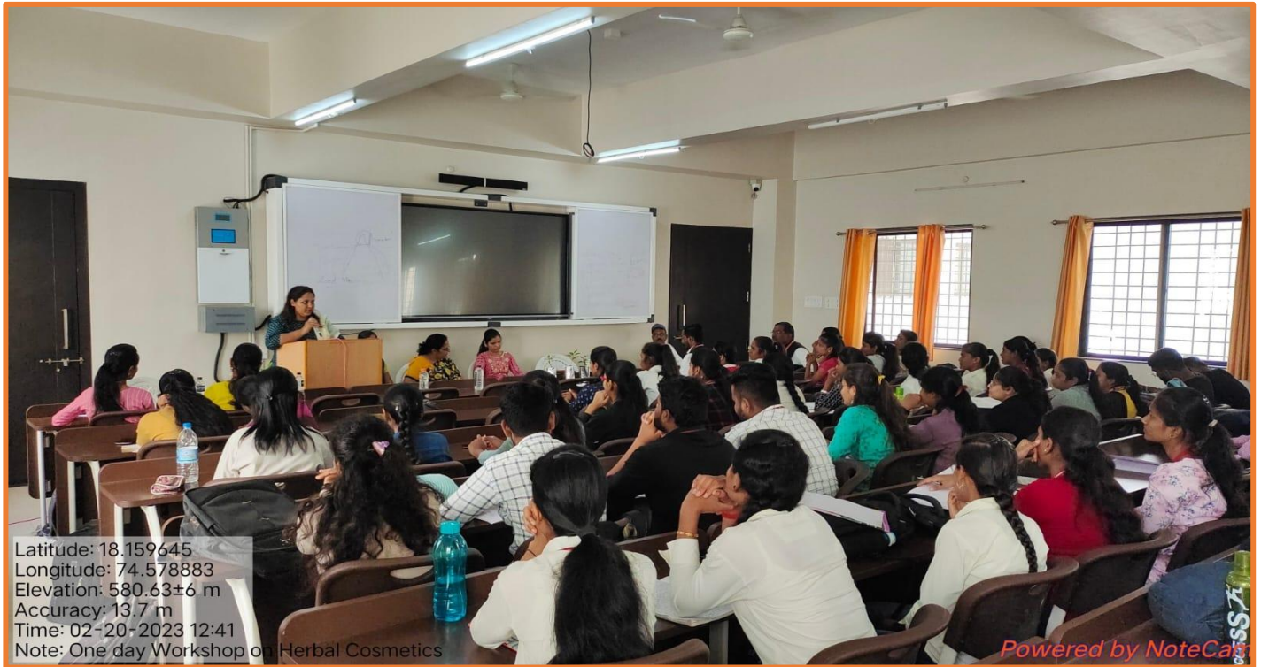
Herbal cosmetics expert delivering talk on importance of herbal cosmetics.