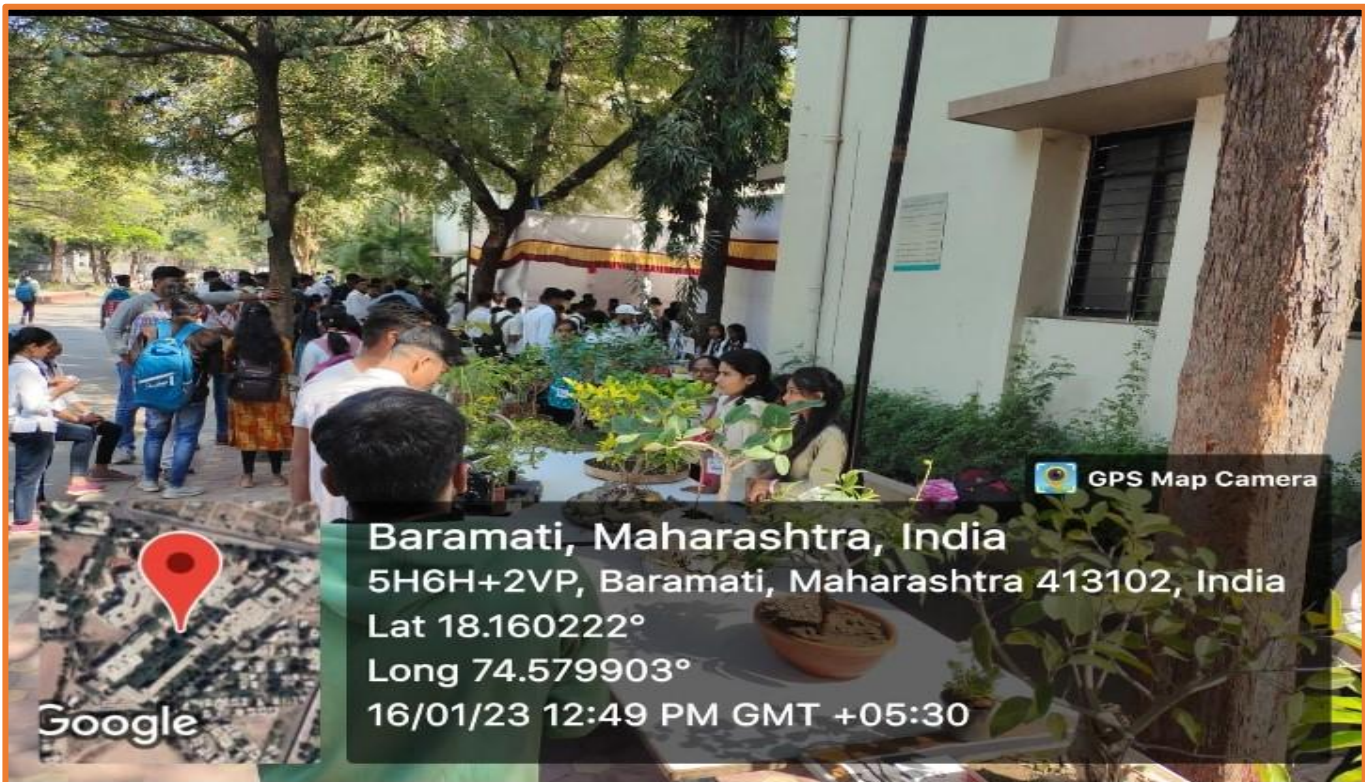
Bonsai plant stall in business fair.