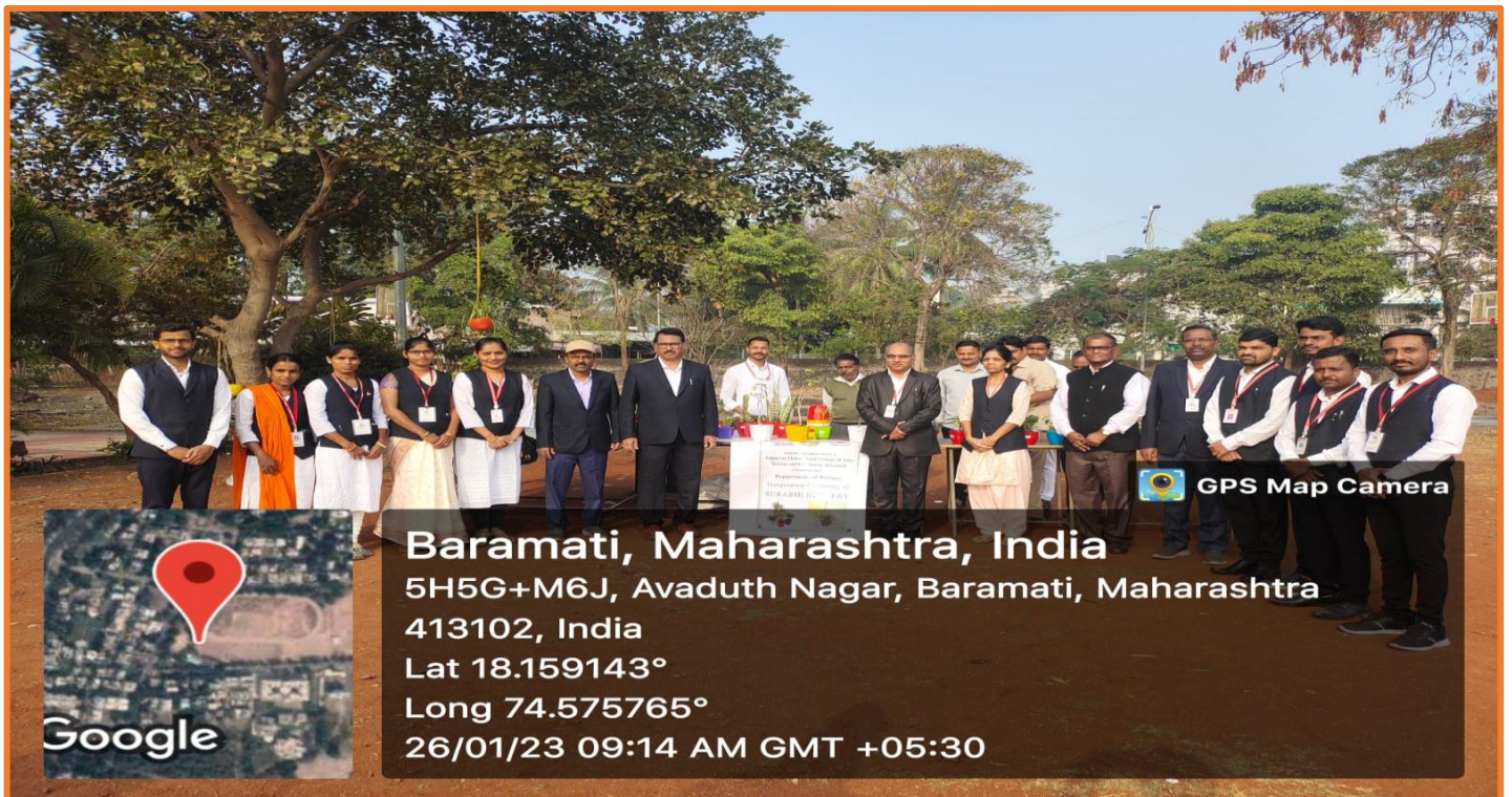
Dignitaries visited to the Surabhi Nursery.