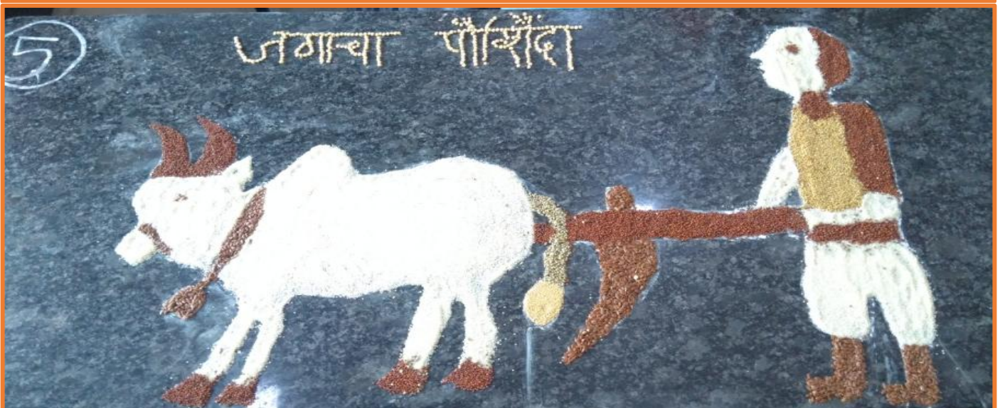
The picture drawn with the help of milets