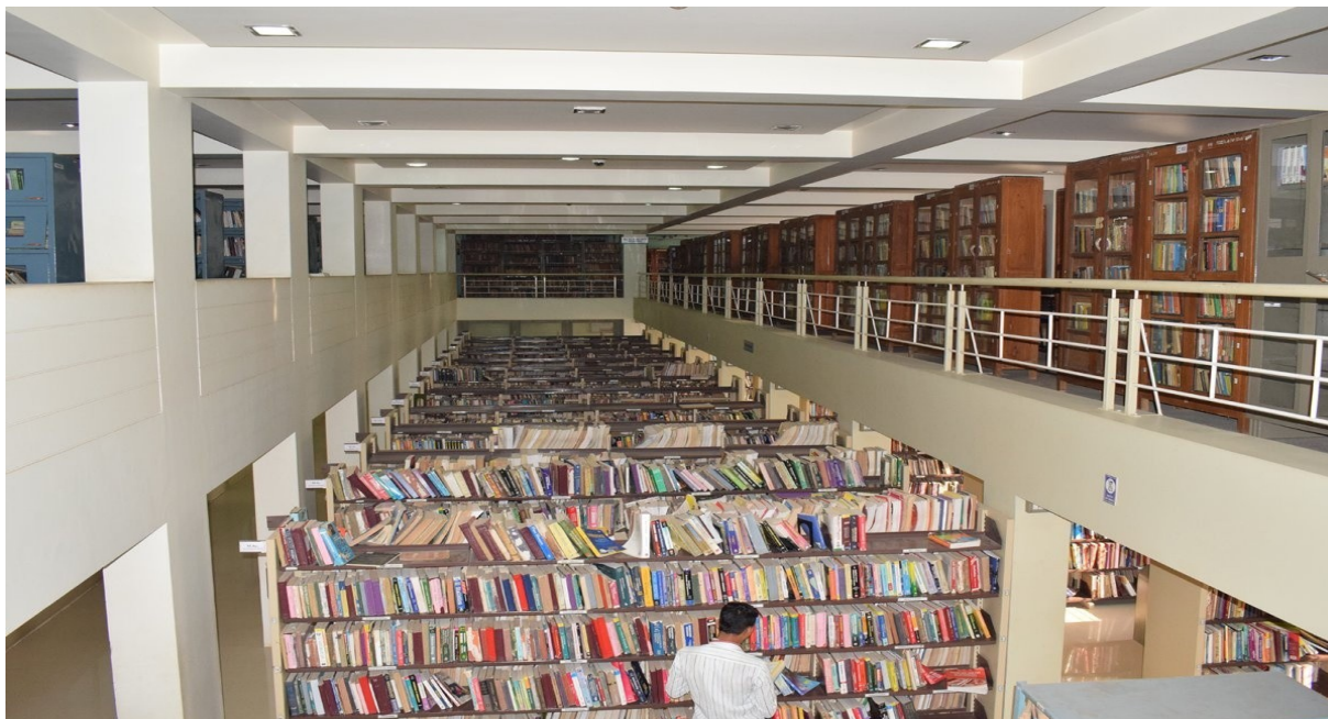
Library of the college