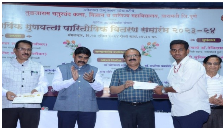
Annual Prize Distribution 2023 - 24

5. Bridge Course for New Students: To support new students, particularly those who may face challenges in transitioning to the current syllabus, the college offers a Bridge Course at the beginning of the academic year. Although designed for all students, this course is especially beneficial for weak learners, helping them bridge gaps in their understanding and providing clear direction for further studies. It allows students to clarify doubts and prepares them to engage more effectively with the curriculum.