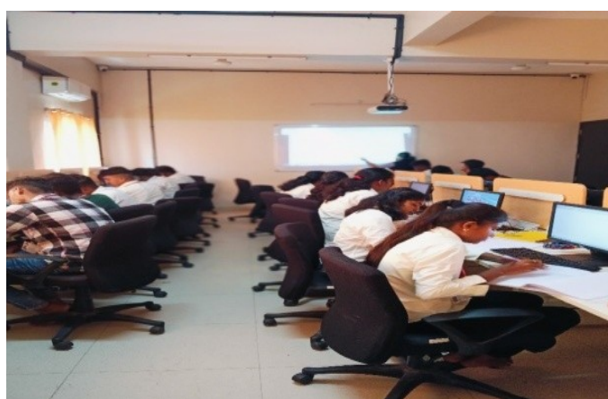
ICT Classroom in the College