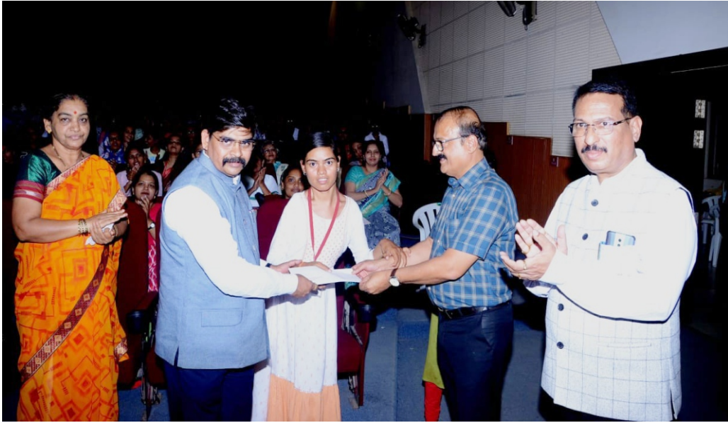
Felicitation of differently able bright student