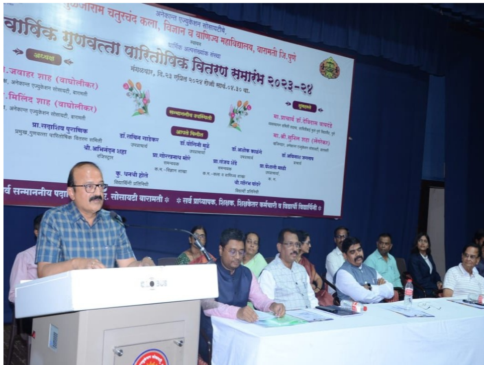
Inspiring Words from the Secretary of Anekant Education Society at the Annual Prize Distribution