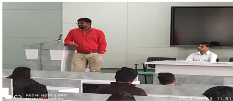
Seminar on "Fundamentals of Robotics" 22-10-2019