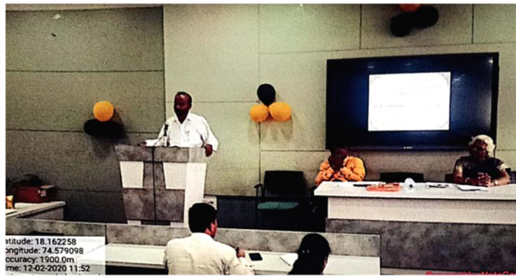
Sutrasanchalan Workshop 12-02-2020