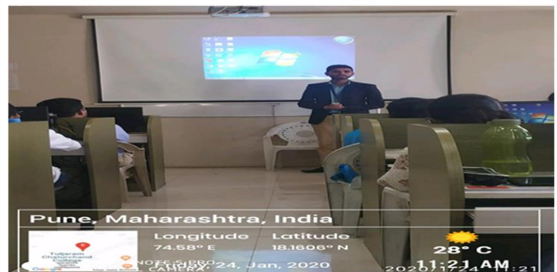
Pune, Maharashtra, India