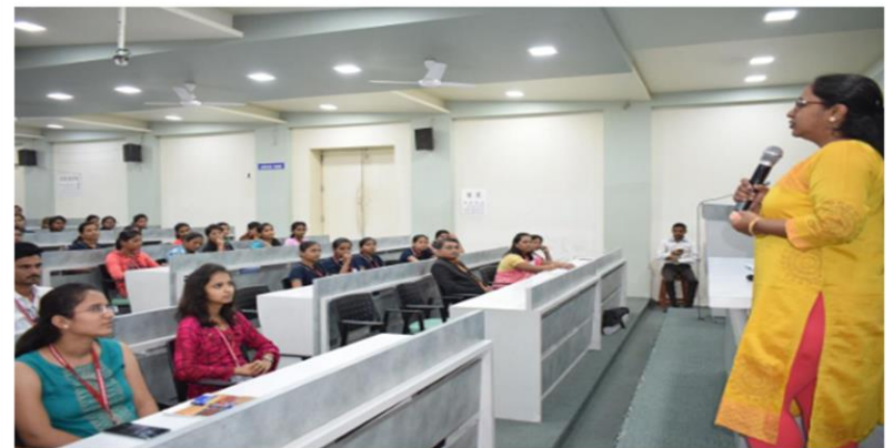
Seminar on "Redhat technologies and SAS software" 06-08-2019