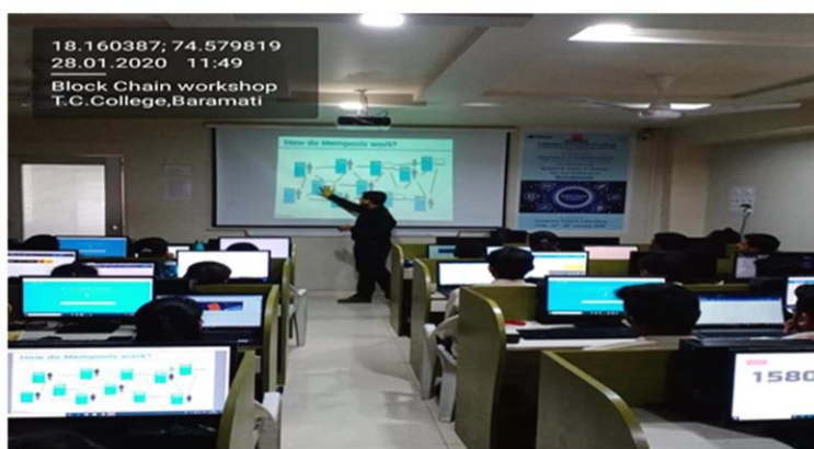
18.160387; 74.579819 28.01.2020 11:49 Block Chain Workshop T.C.College,Baramati