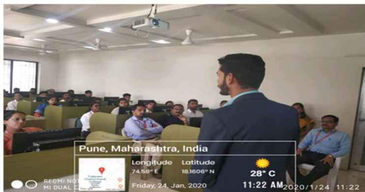
Pune, Maharashtra, India