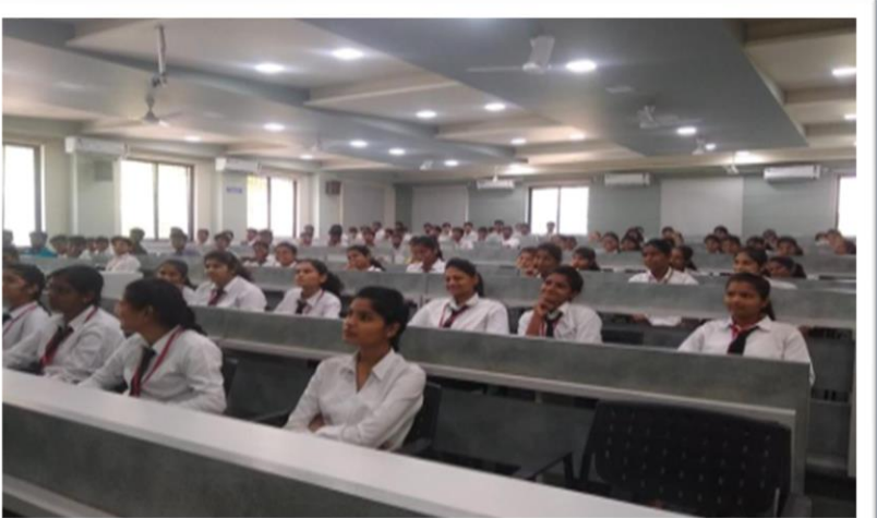
Seminar on "Fundamentals of Robotics" 22-10-2019