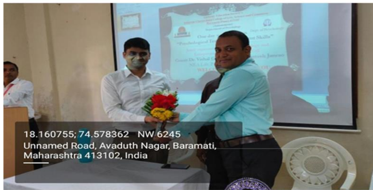
18.160755; 74.578362 NW 6245 Unnamed Road, Avaduth Nagar, Baramati, Maharashtra 413102, India