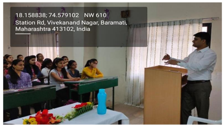
18.158838; 74.579102 NW 610 Station Rd, Vivekanand Nagar, Baramati, Maharashtra 413102, India