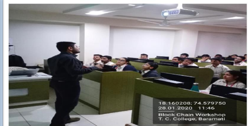
18.160208; 74.579750 28.01.2020 11:46 Block Chain Workshop T. C. College, Baramati