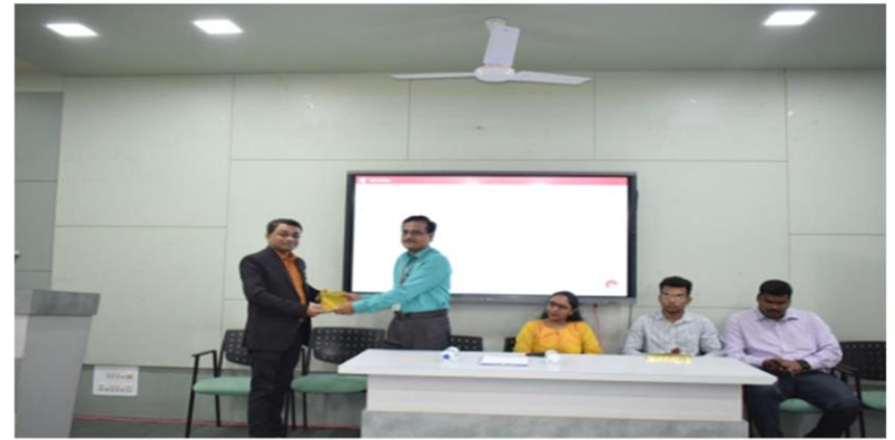
Seminar on "Fundamentals of Robotics" 22-10-2019