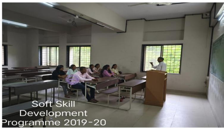
Soft Skill Development Programme 2019-20