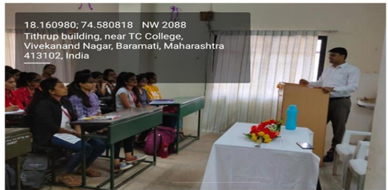
18.160980; 74.580818 NW 2088 Tithrup building, near TC College, Vivekanand Nagar, Baramati, Maharashtra 413102, India