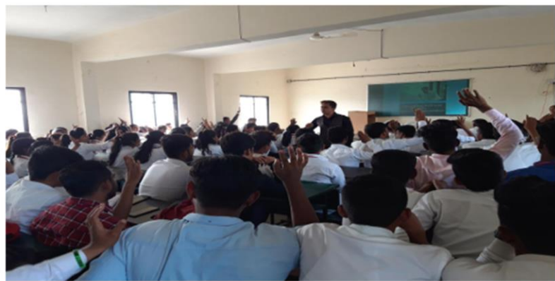
Guest lecture on Be a smart investor: 18-09-2019