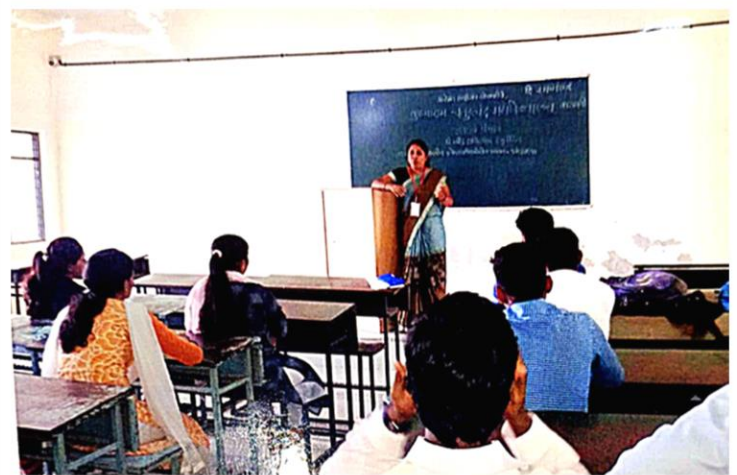
Seminar on memorial day of Dr. Narendra Dabholkar 21-08-2019