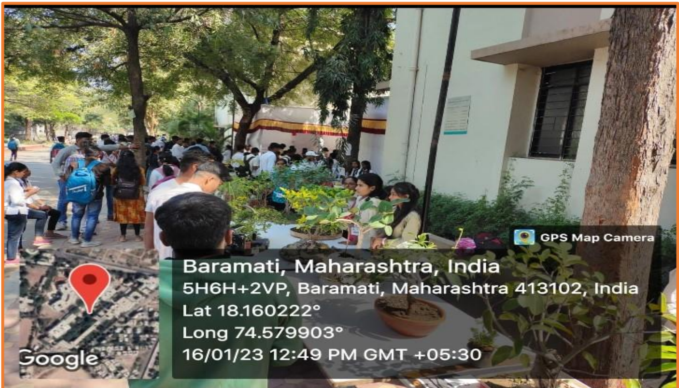
Bonsai plant stall in business fair.