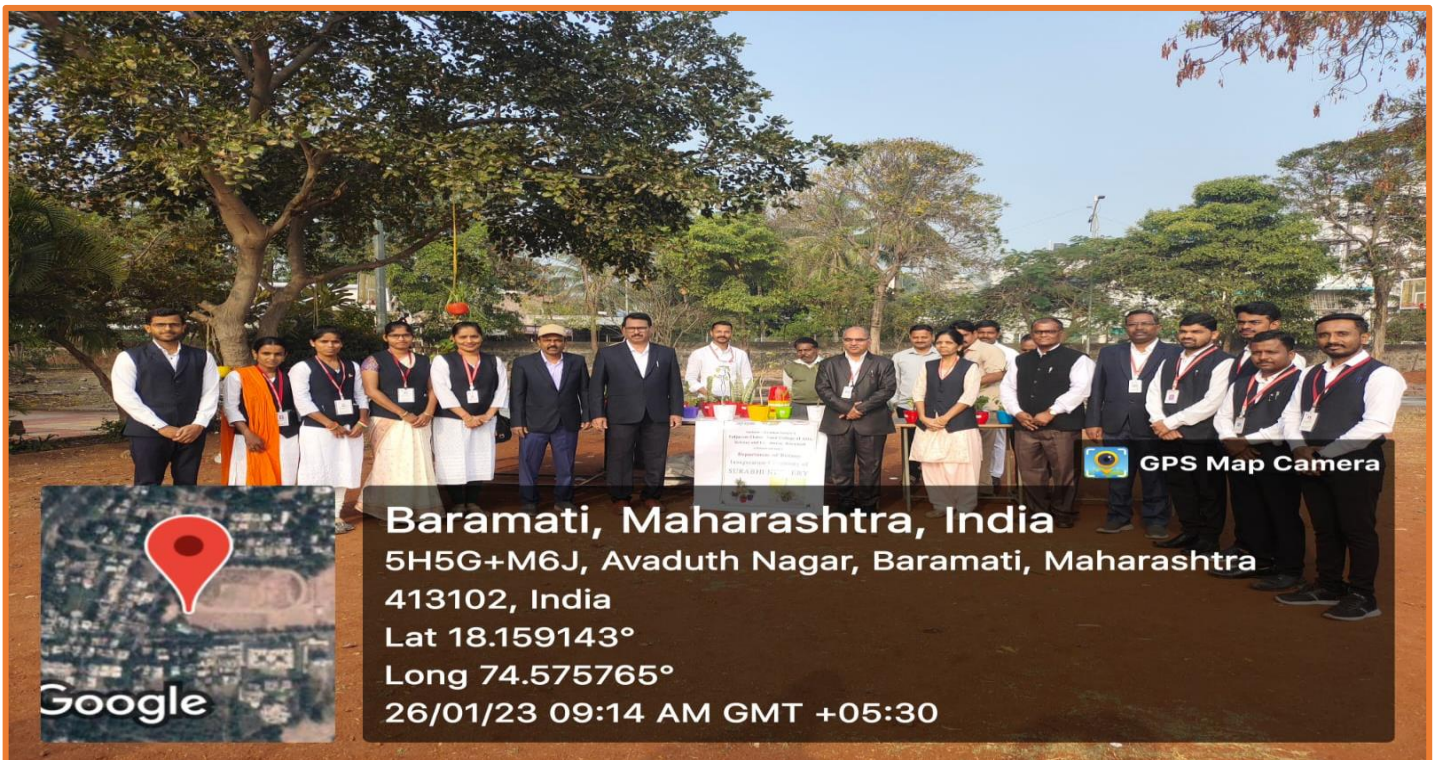
Dignitaries visited to the Surabhi Nursery.