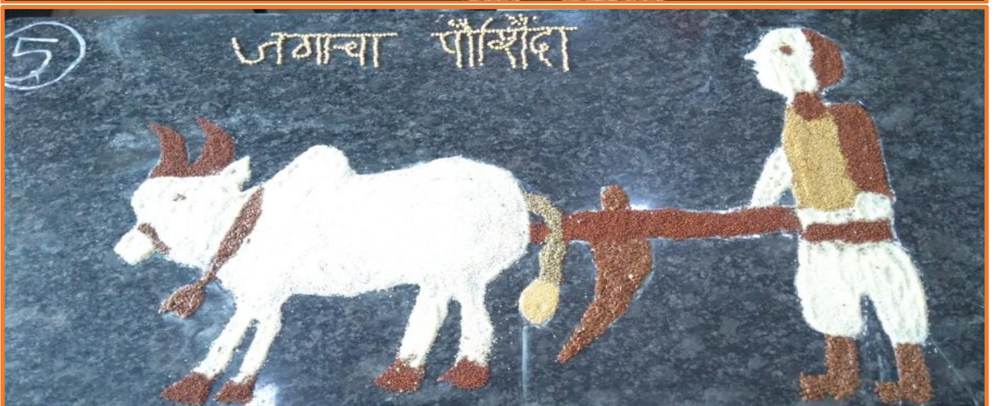
The picture drawn with the help of millets