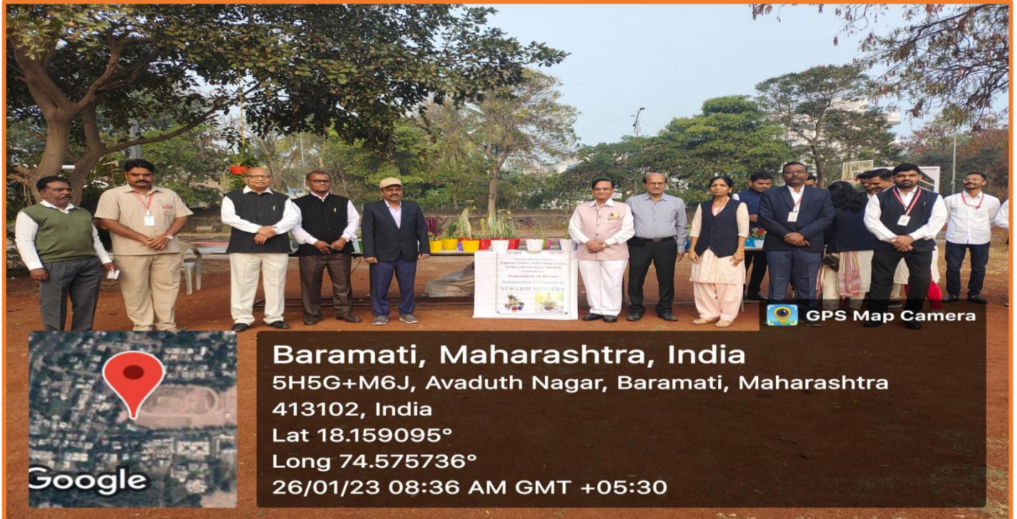
Dignitaries visited to the Surabhi Nursery.