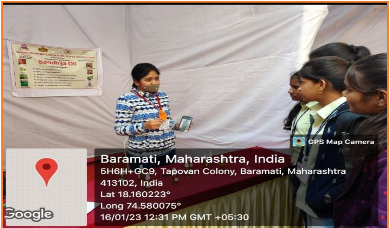
The participants selling their product in bussiness fair