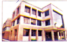
महाविद्यालयाने उभारलेले व्होकेशनल सेंटर

विद्यापीठ अद्वयन आयोग, नवी दिल्ली यांच्या सहयोगाने व अजुनातून आणि सावित्रीबाई फुले