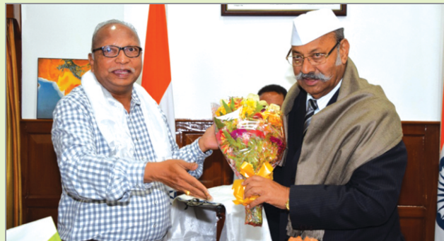
Visit to Hon'ble Governor of Sikkim, Shri. Shrinivas Patil