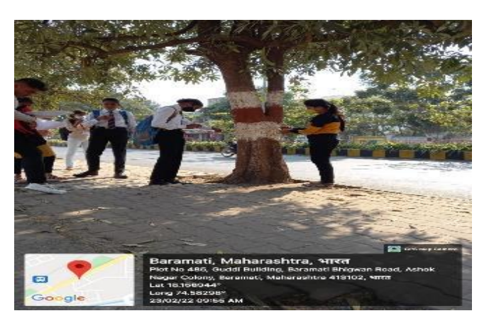
Vaccniation Drive ( Puls Polio immunation )