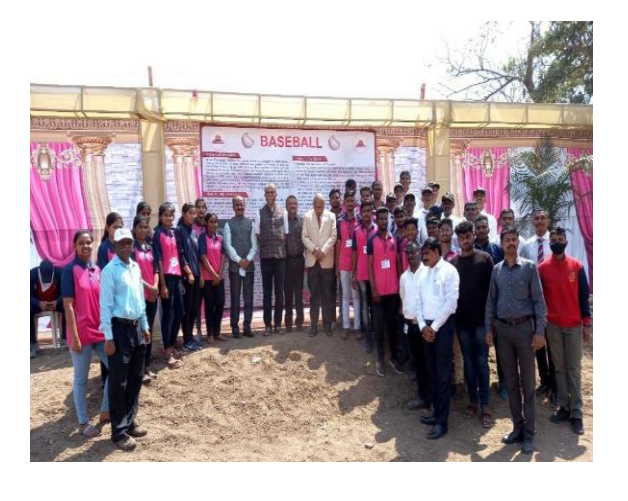
Strret Play team with Wining Trophy