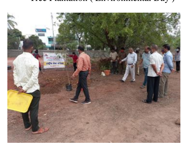
Tree Plantation ( Environmental Day )