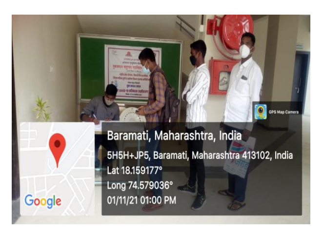
Covid- 19 Vaccination at College