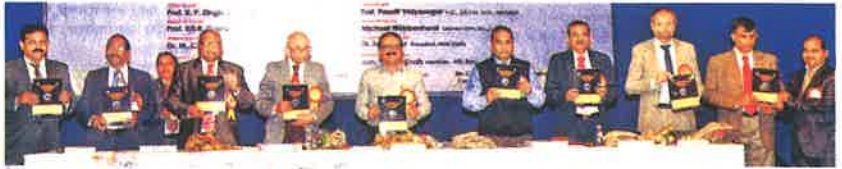
बारामती येथील तुळजासम चतुर्वेद महाविद्यालयात अप्लाईड नॅनो टेक्नॉलॉजी व नॅनो सायन्स या विषयातील आंतरराष्ट्रीय परिषदेचे आयोजन करण्यात आले आहे.