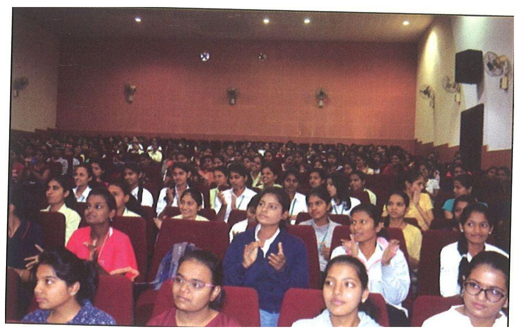
Nirbhay kanya Workshop