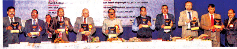
बारामती येथील तुळजाग्राम चतुर्वर्धन महाविद्यालयात अप्लाइड नॅनो टेक्नॉलॉजी व नॅनो सायन्स या विषयातील आंतरराष्ट्रीय परिषदेचे आयोजन करण्यात आले आहे.

इतिहासामध्ये आणि विकासामध्येही महाराष्ट्राचे स्थान अग्रगण्य आहे. देशाच्या शेती क्षेत्रातील सर्वांगीण विकासातील माजी केंद्रीय कृषिमंत्री शरद पवार यांचे योगदान अत्यंत महत्वाचे आहे. त्यांच्याच कार्यक्षेत्रात या आंतरराष्ट्रीय परिषदेचे आयोजन करणे स्तुत्य आहे. त्याचबरोबर भारतातील जैव कच्च्याचे रूपांतर ऊर्जानिर्मितीसाठी नॅनोटेक्नॉलॉजीचा वापर केल्यास भारताच्या विकासासाठी लागणारी ऊर्जाही भूक भागवली जाऊ