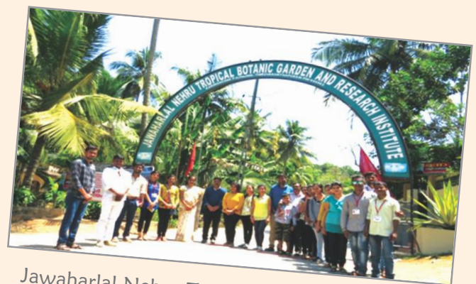
Jawaharlal Nehru Tropical Botanic Garden and Research Institute (JNBTRI) Palode, Kerala