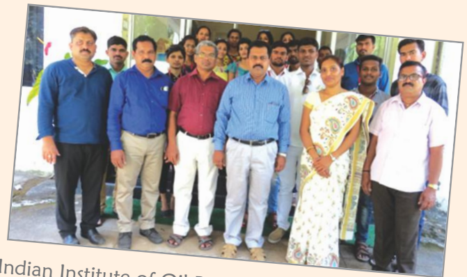
Indian Institute of Oil Palm Research Centre Palode

4) The Department of Botany organized study tours of T.Y. B.Sc. students at Hyderabad, Telangana between 4th February to 9th February 2018, S.Y. B. Sc. to Aundh (Satara) on 17th February 2018 and of M. Sc.-I to Kerala between 26th February to 06th March 2018.